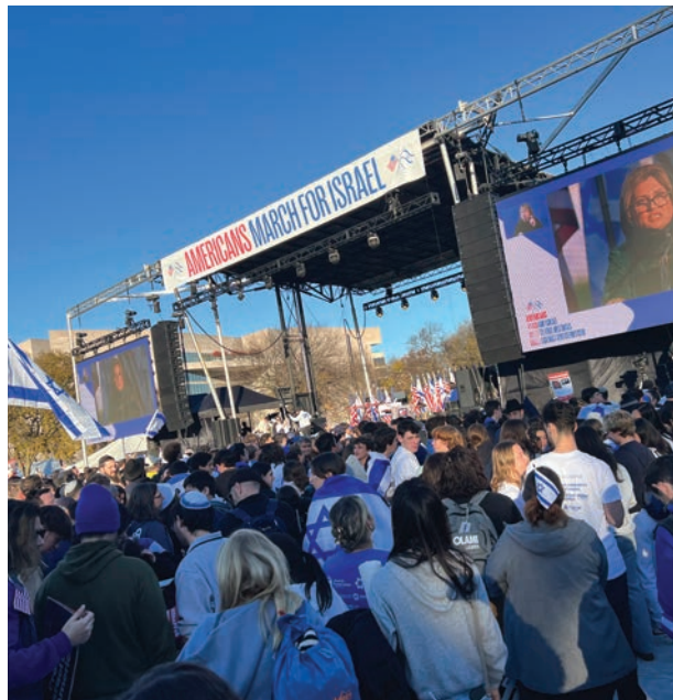
TE marches for Israel.